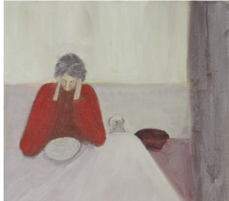
Untitled, 2015, Acrylic on canvas, 20 x 30 cm Courtesy Cécile Savelli @ ADGAP, Paris