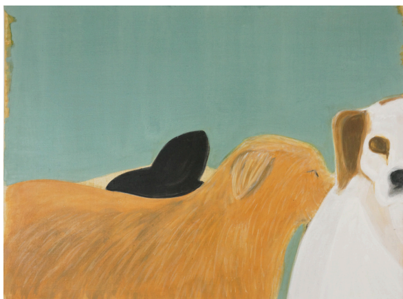
Untitled, 2015, Acrylic on canvas, 46 x 61 cm Courtesy Cécile Savelli @ ADGAP, Paris