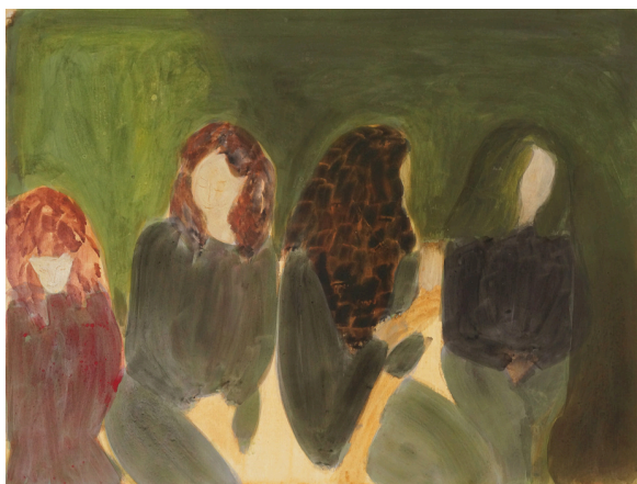
Untitled, 2015, Acrylic on canvas, 46 x 61 cm Courtesy Cécile Savelli @ ADGAP, Paris