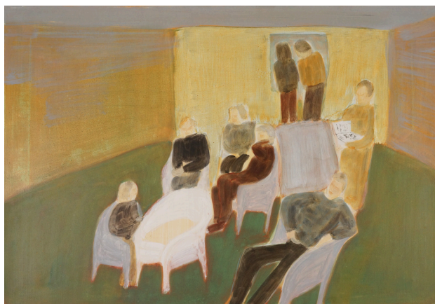
Untitled, 2015, Acrylic on canvas, 42 x 61 cm Courtesy Cécile Savelli @ ADGAP, Paris