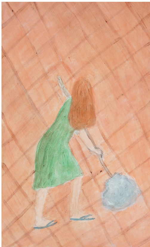
Household self-portrait , 2009, wax painting on wood, 50 x 30 cm