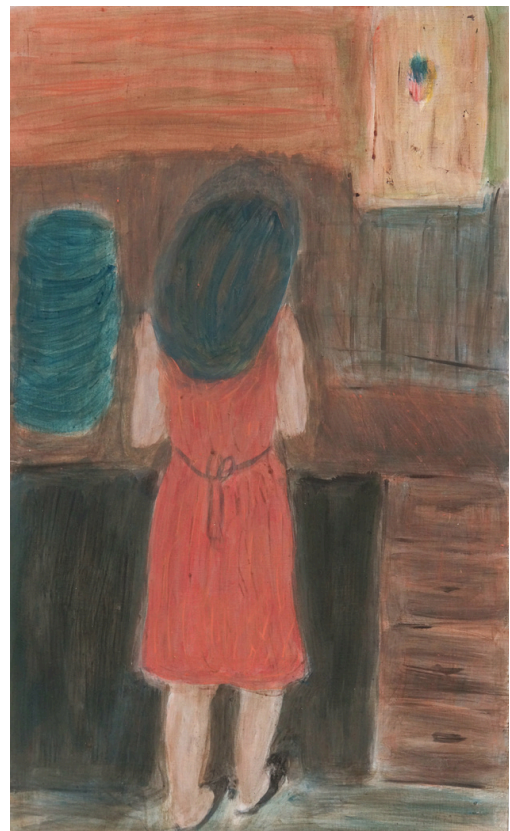
Household self-portrait , 2009, wax painting on wood, 50 x 30 cm