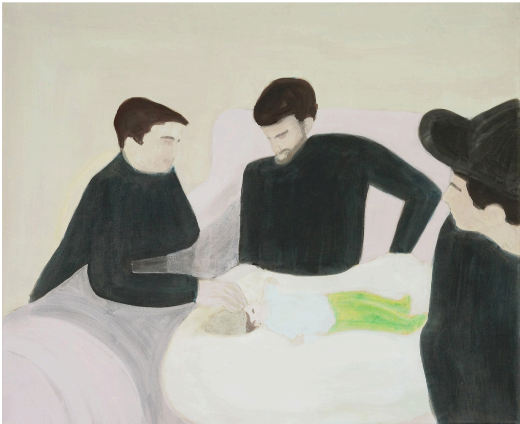
Untitled, 2015, Acrylic on canvas, 46 x 55 cm, Courtesy Cécile Savelli @ ADGAP, Paris

OPENING IN THE PRESENCE OF THE ARTIST SATURDAY 19 APRIL