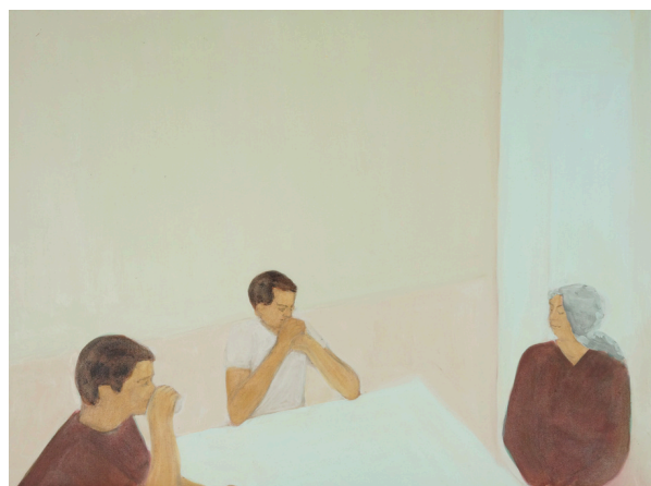
Untitled, 2015, Acrylic on canvas, 46 x 61 cm