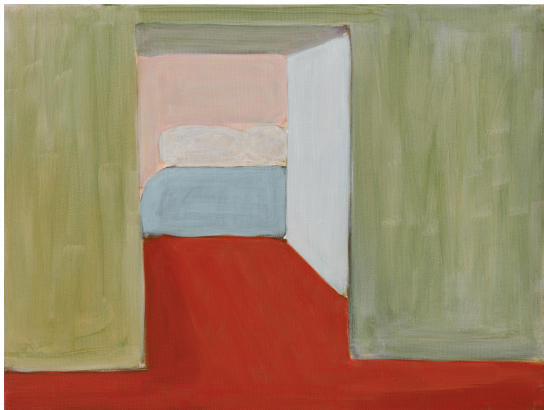
Untitled, 2024, Acrylic on canvas, 46 x 61 cm Courtesy Cécile Savelli @ ADGAP, Paris