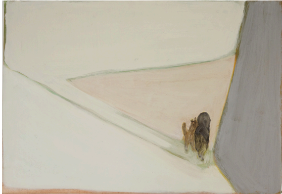
Untitled, 2015, Acrylic on canvas, 38 x 55 cm