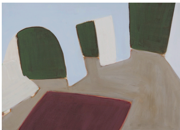
Untitled, 2019, Acrylic on canvas, 38 x 55 cm Courtesy Cécile Savelli @ ADGAP, Paris