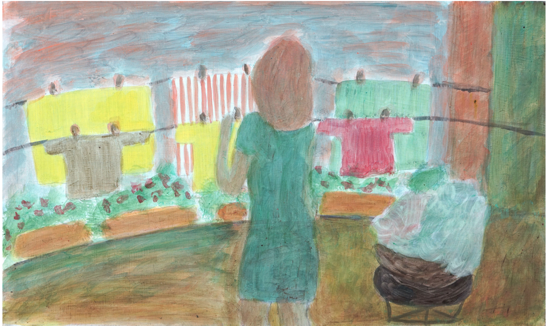
Household self-portrait , 2009, wax painting on wood, 30 x 50 cm