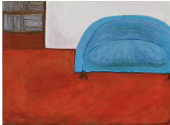
Untitled, 2024, Acrylic on canvas, 97 x 130 cm Courtesy Cécile Savelli @ ADGAP, Paris