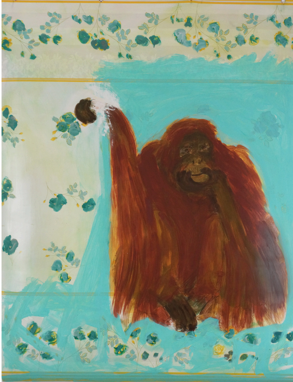
Untitled, 2017, Acrylic on oilcloths, 127 x 105 cm